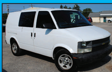
2005 CHEVY ASTRO CARGO VAN Locking cabinets. SALE PRICE $7,995