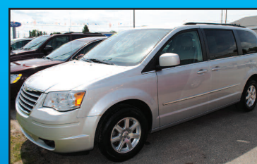
2009 TOWN & COUNTRY TOURING Automatic sliding doors, Swivel-N-Go seats, leather, 4 captain chairs, Sirius, MP3, DVD. SALE PRICE JUST $13,500