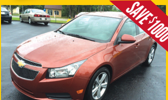
2013 CHEVY CRUZE 2LT Loaded with Leather Trim PAYMENTS AS LOW AS $249/MO*