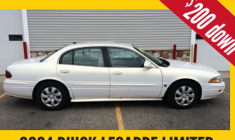
2004 BUICK LESABRE LIMITED Six passenger with great fuel economy PAYMENTS AS LOW AS $100/MO*