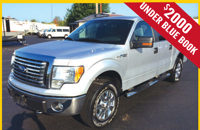
2010 FORD F150 SUPER CREW 4X4 SALE PRICE $18,995 00 ★ LIKE NEW, WON'T LAST LONG!