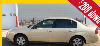
2005 CHEVROLET MALIBU Popular Family Sedan PAYMENTS AS LOW AS $169/MO*