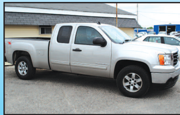
2008 GMC SIERRA SLE 4x4, Z-71 pkg, bedliner, tow pkg, seats 5. AS LOW AS $249 A MONTH