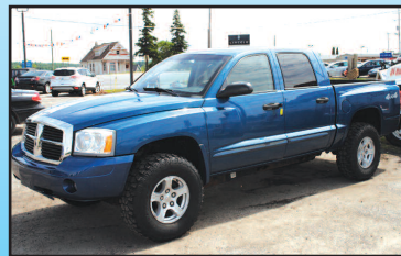
2005 DODGE DAKOTA SLT 4 door, V-8 Magnum, bedliner, 4x4, tow pkg, off road tires, JVC sound, seats 5. SALE PRICE $9,900