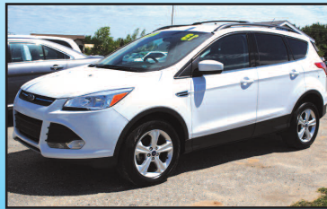
2013 FORD ESCAPE SE Eco-Boost, Sirius radio, steering wheel controls, SYNC, handsfree phone. Like new. $269 A MONTH OR LESS