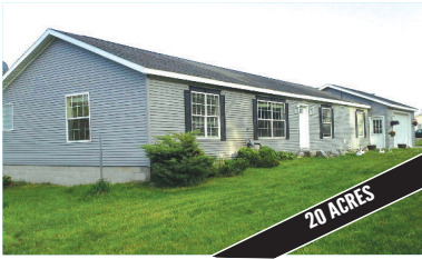
7890 BURGESS ROAD, CHARLEVOIX Picturesque country setting and centrally located to Charlevoix, Boyne City and Petoskey. MLS 439512. Ask for Jennifer Burr. $126,900