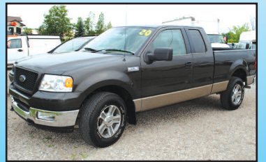
2005 FORD F-150 XLT 4x4, chrome trim, bedliner, tow pkg, seats 5. AS LOW AS $199 A MONTH