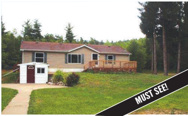
06946 MAPLE GROVE., CHARLEVOIX Located in BUCK country! Quiet country living on 10 acre parcel. Manufactured home with full basement that is mostly finished. MLS 441842. Ask for Mike Stark. $129,900