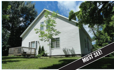
6556 CENTER, ELLSWORTH This home has been completely remodeled! Features master suite, large kitchen w/bar and a beautiful fieldstone fireplace. MLS 441389. Ask for Jennifer Burr. $89,900