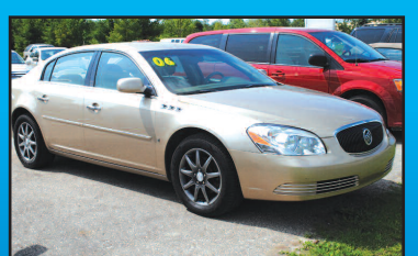
2006 BUICK LUCERNE CXL Leather, steering wheel controls, OnStar SALE PRICE $6,999

989 VFW RD., CHEBOYGAN, MI • 231-627-6700 • WWW.RIVERAUTO.NET