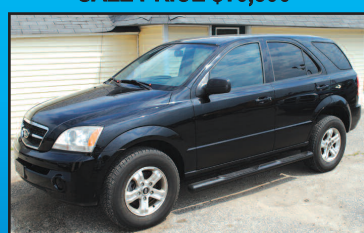
2003 KIA SORENTO LX 3.5 L, 6 Cyl, air. AS LOW AS $199 A MONTH