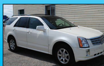
2008 CADILLAC SRX 4 Leather, AWD, double moonroof, 3rd row seat, loaded. SALE PRICE $10,500