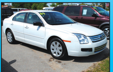
2009 FORD FUSION One owner, 76 K, MP3, great MPG. SALE PRICE $9,900