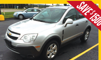
2013 CHEVY CAPTIVA SPORT Great Economical SUV PAYMENTS AS LOW AS $249/MO*