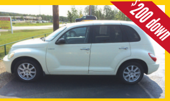
2006 PT CRUISER LIMITED Low miles and Moonroof PAYMENTS AS LOW AS $129/MO*