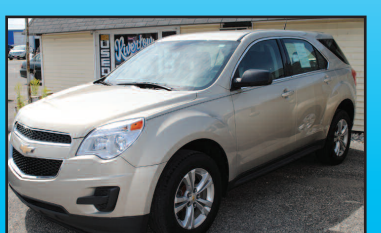
2012 CHEVY EQUINOX AWD, OnStar, one owner. SALE PRICE $18,995