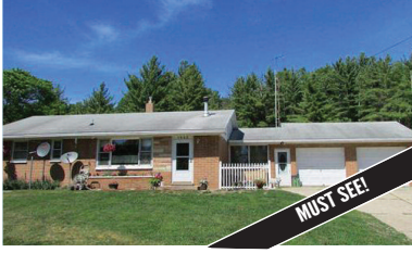
1962 W OLD STATE., EAST JORDAN Charming home with lots of country appeal and room to play, wildlife all around. A nice pond at the edge of the yard. MLS 441492. Ask for Chris Oliver. $127,900