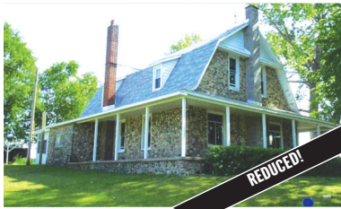
9588 ATWOOD ROAD, CHARLEVOIX This stone home has an enormous porch, 3 large bedrooms 2 full baths and an open and welcoming feeling throughout. MLS 439362. Ask for Holly Nierman. $134,900

A very nice larger parcel that offers a little bit of everything!! Nicely wooded areas and some open fields. The possibilities are endless with this parcel. Great Hunting in the area. Large enough for that family retreat or hunting camp. Maybe even that golf course or camp ground you have always thought about building. Only a couple miles from downtown East Jordan! MLS 441891. Ask for Chris Oliver.