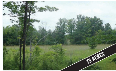
0 VANCE RD., EAST JORDAN With a view that goes for miles and miles and yet uninterrupted... this 73 acre piece of land is quite heavenly. MLS 441678. Ask for Jennifer Burr. $119,000