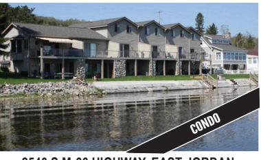
2540 S M-66 HIGHWAY, EAST JORDAN 2199sq ft condo with 22ft waterfront on the SOUTH ARM of LAKE CHARLEVOIX. 3 BR, 3 1/2 BA, new deep water boat slip. MLS 440455. Ask for Mike Stark. $299,900