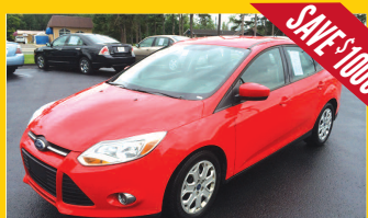
2012 FORD FOCUS SE Comfort and Great Fuel Economy PAYMENTS AS LOW AS $199/MO*