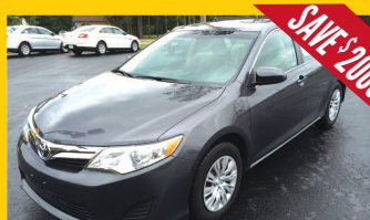
2013 TOYOTA CAMRY America's Most Popular Sedan PAYMENTS AS LOW AS $279/MO*