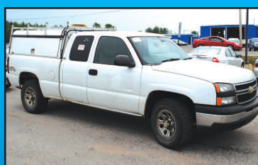
2007 CHEVY SILVERADO LS 4x4, 4 door, ARE cap, ladder rack, hitch. AS LOW AS $149 A MONTH