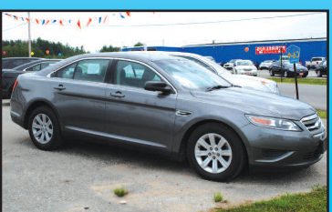
2011 FORD TAURUS Sirius, CD. Only 60 K. 29 MPG. SALE PRICE $15,995