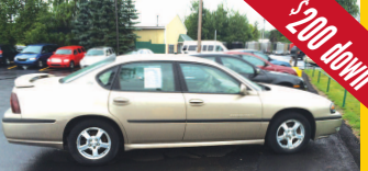
2003 CHEVROLET IMPALA Only 91000 miles, leather seats PAYMENTS AS LOW AS $189/MO*

Ask about our Guaranteed Credit Approval