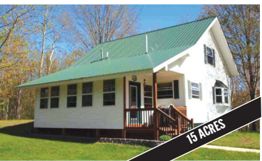
05120 BC/EJ, EAST JORDAN Well constructed like new home close to town. Includes 15 acres with a 30 x 40 insulated, heated pole barn. MLS 440712. Ask for Mike Stark. $169,000

Looking for a move-in ready home with lots of square footage to stretch out in, elegance for entertaining, close to town to stay involved, garage space for cars AND your toys? This one you really need to see! Call for your personal tour today! MLS 441874. Ask for Jennifer Burr.