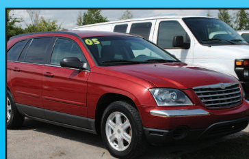
2005 CHRYSLER PACIFICA TOURING Very nice Crossover. SALE PRICE $5,900