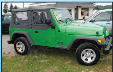
2005 JEEP WRANGLER 4x4, auto, only 66 K. SALE PRICE $12,500